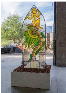
Timo Fahler sunrise it don't lay. comparative mythologies; el quinto sol from the snake-bird's mouth from the catholic church from the templo mayor from the dirt red dirt , 2021 steel, rebar, stained glass 87 x 36 x 18 inches