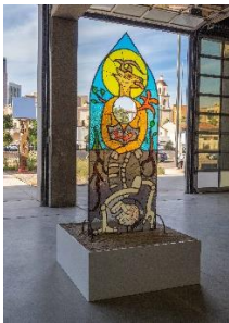
Timo Fahler day break it don't fall. comparative mythologies; Mazatl has a vision of Narcissus and sees its infinite doom , 2021 steel, rebar, stained glass 87 x 36 x 18 inches Courtesy of Jordan S. Goodman Collection