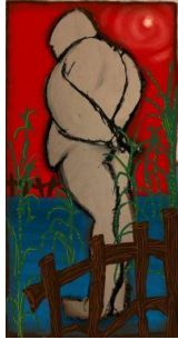
Marcus Masaki Rodriguez Oasis Rojo (Red Oasis) , 2023 Acrylic and charcoal on wood 48 x 24 x 2 1/2 inches